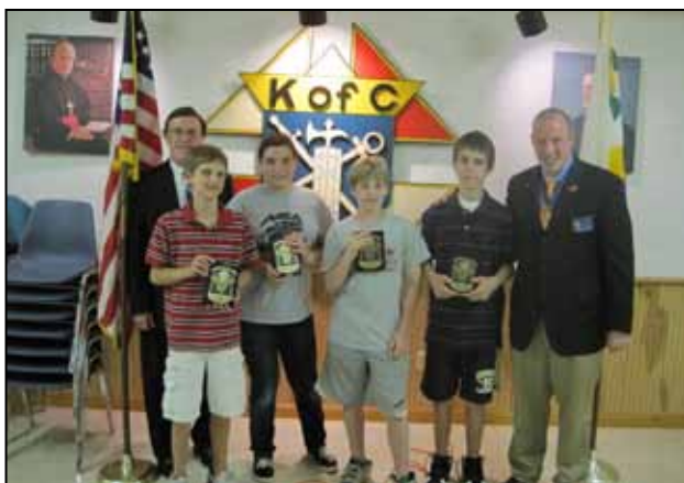
Free Throw Contest

We are proud to be an active Council. These activities are rewarding to us personally as well as the individuals and organizations we proudly assist. If you are not a member - we invite you to join our Council and participate in any activity which best suits you. New ideas are always welcome!