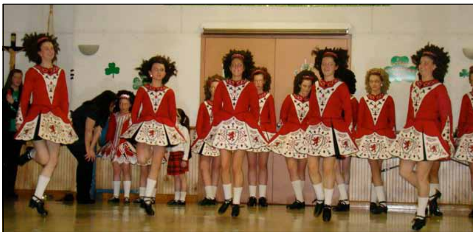
St. Patrick's Day Dinner/Dance