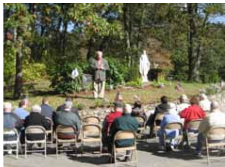
Rosary for the Unborn