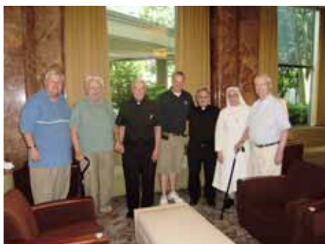
At Regina Cleri